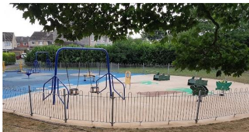
St Francis Grove Play Area

Laceby Village Council is responsible for: