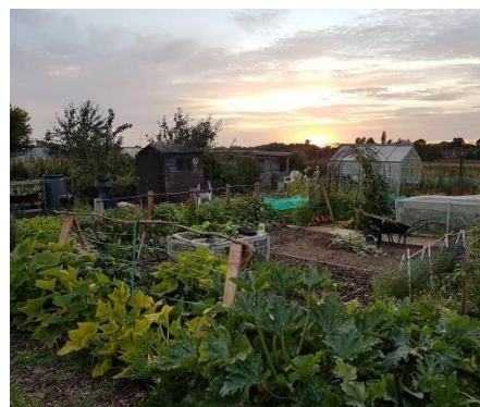
Sunset on Laceby Allotments

Contact details for your Councillors are on the noticeboard in The Square, and the Laceby Council Website – www.laceby-parish-council.net